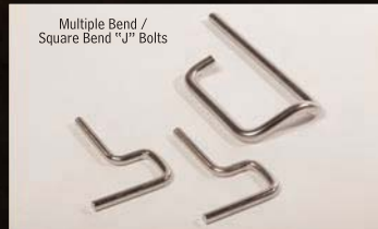
Multiple Bend / Square Bend "J" Bolts