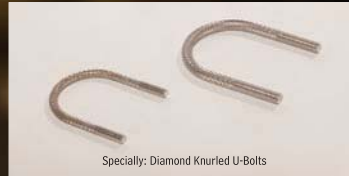
Specially: Diamond Knurled U-Bolts