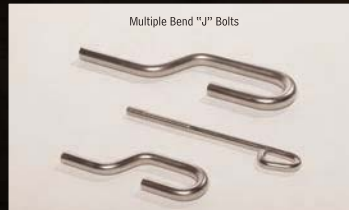
Multiple Bend "J" Bolts