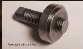
Pipe Leveling Plate & Rod