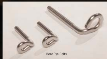
Bent Eye Bolts