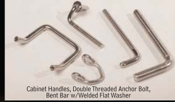
Cabinet Handles, Double Threaded Anchor Bolt, Bent Bar w/Welded Flat Washer

With the expertise provided by our trained design and manufacturing teams, you can count on your parts being fabricated to your exact specifications in a timely and professional manner. We remain committed to the quality control and reliability required to meet and exceed your expectations and standards.