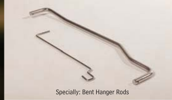
Specially: Bent Hanger Rods